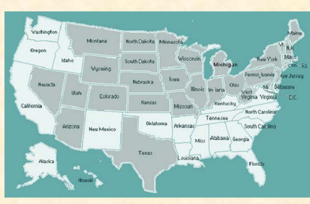
States Eligible to Participate in the LGM-Dairy Program (Darker Gray), 2008